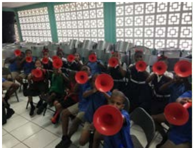
From top to bottom Down Syndrome Family Network’s Conference