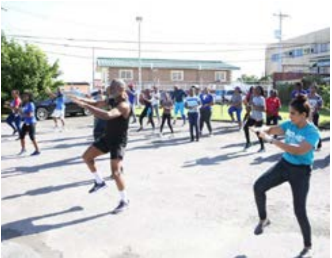
From left to right The La Romaine Diabetic Support Group's World Diabetes Day Walkathon 2019