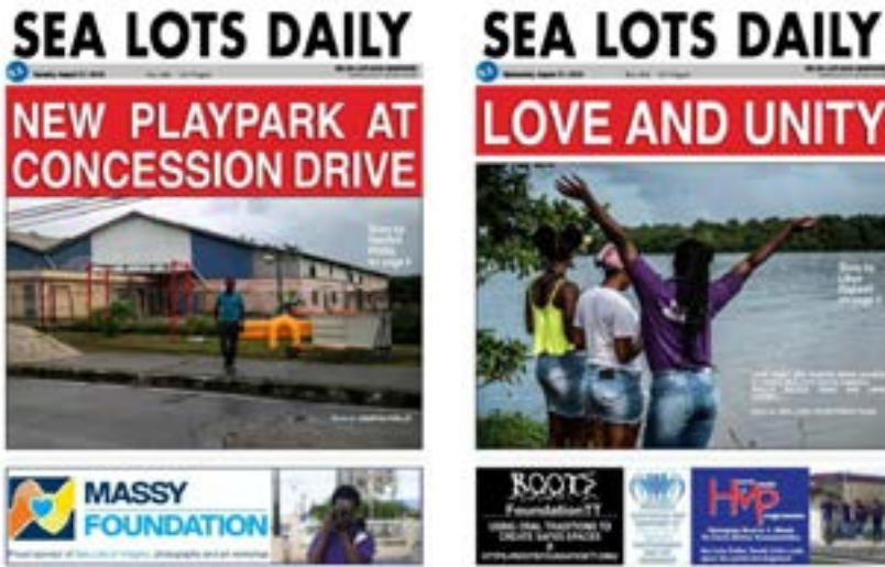
From left to right Hanifah Phillip's front page display for the See Lots of Imagery exhibition