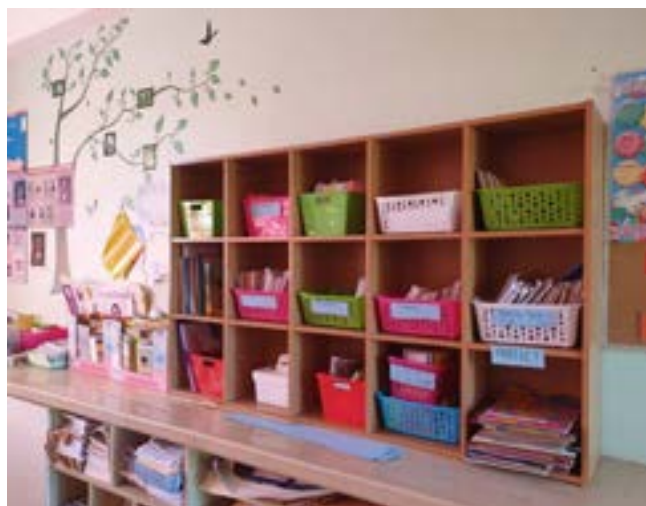
From left to right Student Centric Self-Organized Learning Environment School Education project

The Self-Organised Learning Environment's main requirements are: a computer, internet connectivity, and students who are ready to learn. Within a SOLE, students are free to learn collaboratively via use of